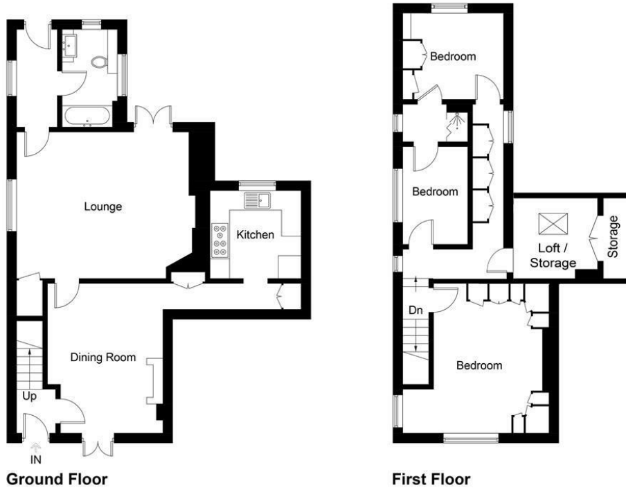
Illustration for identification purposes only, measurements are approximate, not to scale. Fourlabs.co © (ID1173024)

Approximate Gross Internal Area = 126.0 sq m / 1356 sq ft